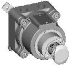
FLP with CLS